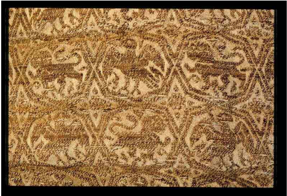
Fig. 6: Detail of the cloth of Charles de Blois's pourpoint. Weft-patterned lampas, silk and gold threads. Ilkhanid manufacture, 14th century.