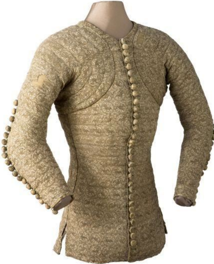
Fig. 5: Pourpoint of Charles de Blois, with kind permission from the Musée des Tissus, Lyon, n. 30307, 924 XVI.2.

chronicle of Agnolo di Tura del Grasso (active in the fourteenth century), the entire cargo was sold successfully in Siena. 30 So a desire to rise in society was met by the new products that helped to realize this ambition, even if only partially: everybody could buy the symbolic-goods in the city markets, legitimately, and in accordance with their own resources, while in the shops the craftsmen were able to make cheap versions of the more valuable artifacts simulating precious materials by tricks of their trade. 31