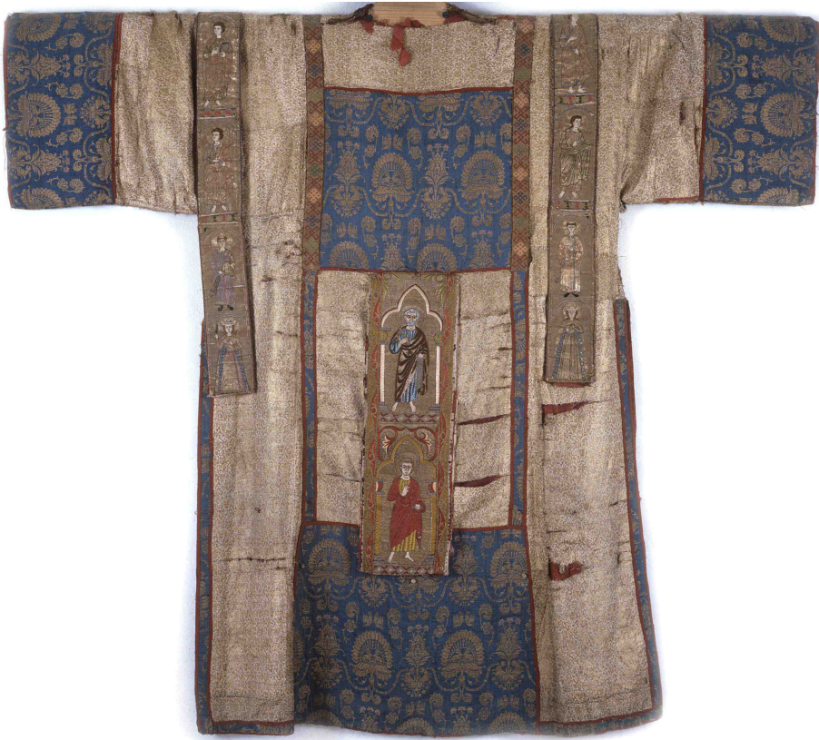
Fig. 3: Dalmatic of Benedict XI, with kind permission from the Church of San Domenico, Perugia.

In contrast, the textiles of Benedict XI's cloak and dalmatic could be attributed to a workshop in Central Asia at the end of the thirteenth century, although both items show the decorative characteristics which are typical of the East Asian repertoire (figures 3–4). 14 The cloak silk (weft-patterned lampas), the main cloth (weft-patterned tabby) and some of a small insert of the dalmatic (weft-patterned lampas) present three variations of a small vegetable decoration, called “tiny patterns” ( de opere minuto ) in Latin sources. 15 Small golden leaves and inflorescences cover the surface in diagonal lines that produce a dynamic, sparkling effect and hide the modular nature of the composition. Single motifs clearly suggest a Chinese origin: peonies, round buds, small comma-shaped leaves and clover with curved tips renew the traditional vegetable repertoire of Islamic textiles. Moreover, the miniature decoration creates a lively sense of movement which is alien to the abstractly fixed and symmetrical styles of earlier Middle Eastern patterns.