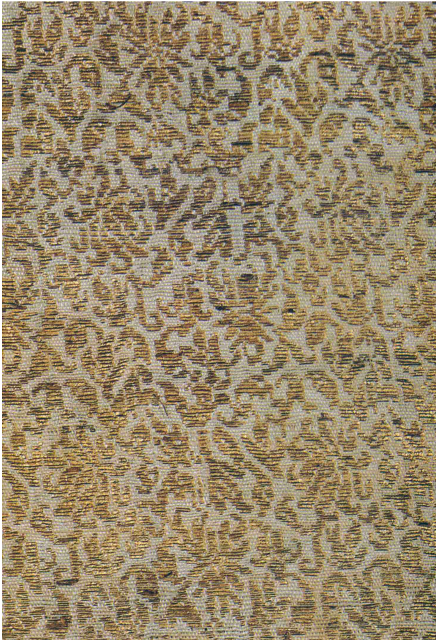
Fig. 4: Detail of the main cloth of Benedict's dalmatic. Weft-patterned tabby, silk and gold threads. Ilkhanid or central Asian manufacture, end of 13th century.