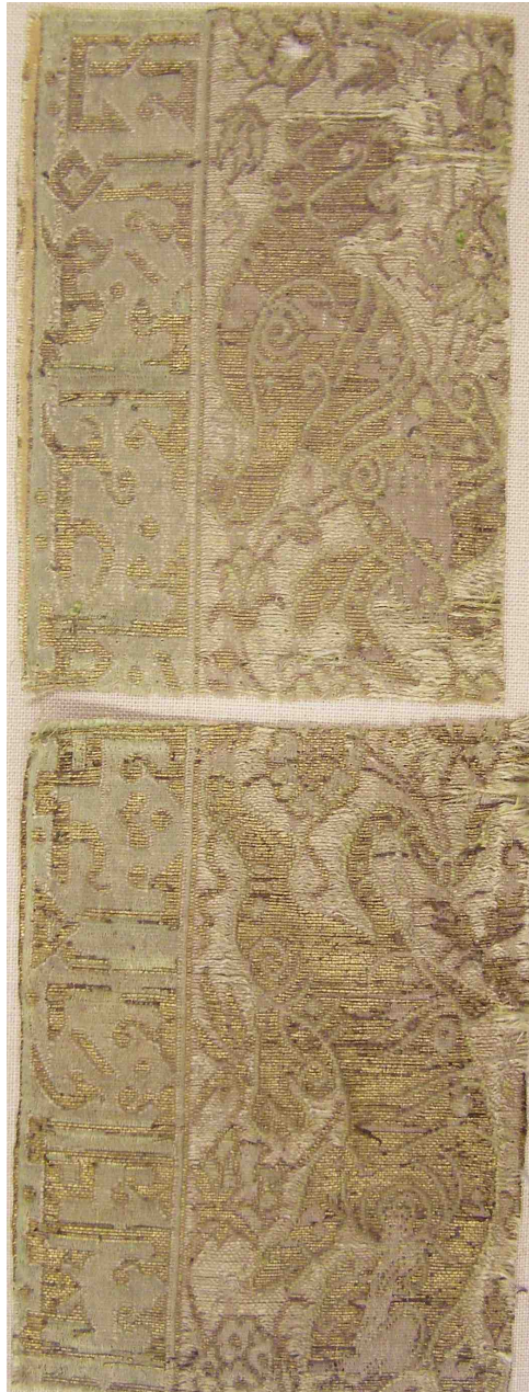
Fig. 1: Fragment of silk with panthers. Weft-patterned lampas, silk, and gold threads. Chinese manufactures, Yuan, second half of 13th century. Courtesy of the Ministry of Cultural Heritage and Activities, Museo Nazionale del Bargello, Florence, nn. 573-574 F.