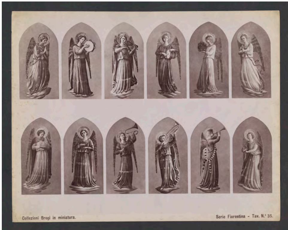
Fig. 8: Collezione Brogi in miniatura, Serie Fiorentina, Plate No. 35, Kunsthistorisches Institut in Florenz – Max-Planck-Institut.

Brogi company, which were acquired for the Fototeca in 1966. 6 In the process, photographs were used that were already far removed from their original pictorial context in Brogi's compilation and then in part de-contextualized again by the actors of the Fototeca's triumphal procession who cropped them.