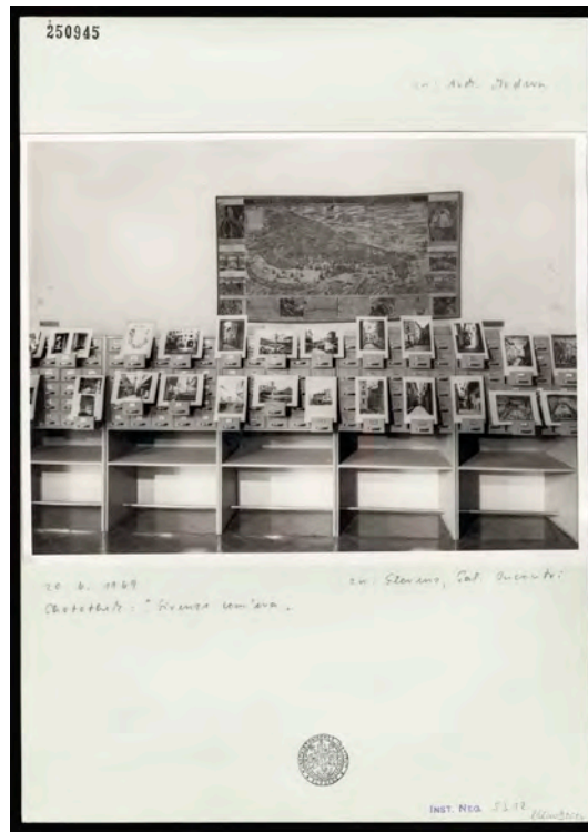
Fig. 2: Exhibition of mounted photographs of the Triumph of Photography in the Fototeca: Firenze com'era, Kunsthistorisches Institut in Florenz – Max-Planck-Institut.

Florence. They often involve celebrations or the visits of important people, all unrelated to everyday life at the institute. The general public does not have access to this binder, which in its own way can be equated to a random collection of pictures that is close to the genre of the family photo album.