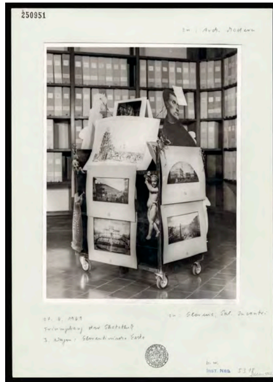
Fig. 7: The Triumph of Photography in the Fototeca: Wagon 3, Florentine Festivals, Kunsthistorisches Institut in Florenz – Max-Planck-Institut.

triumphal wagon of Jupiter that was constructed for a performance in Florence's Teatro della Pergola on January 6, 1838.