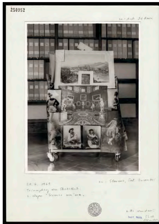
Fig. 6: The Triumph of Photography in the Fototeca: Wagon 2, Firenze com'era, Kunsthistorisches Institut in Florenz – Max-Planck-Institut.

large and mid-format Brogi depictions of women with titles such as The Spring of Life or Interrupted Reading overlap Cimabue's portrait. The dense interweavings of these large and small, cropped and bent photographs evoke a general narrative that at the same time leads our eyes into an art historical mise en abyme .