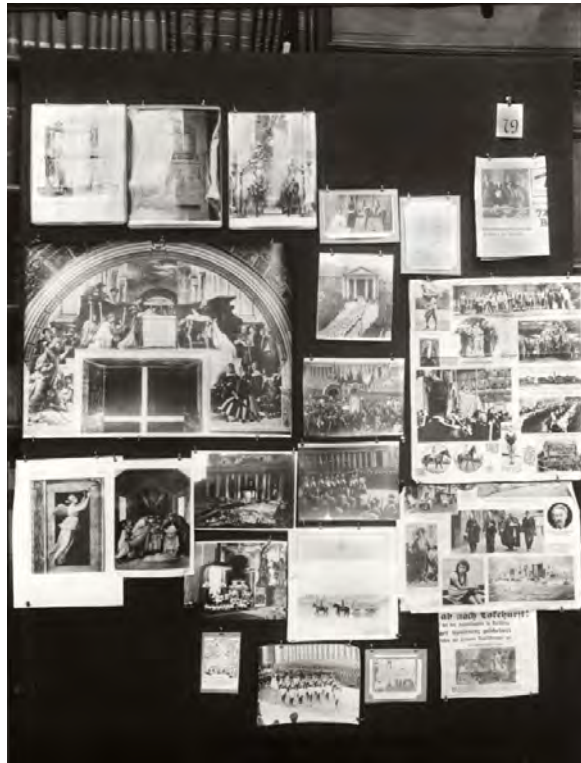
Fig. 9: Aby Warburg's Picture Atlas Mnemosyne, 1927–1929, Plate 79, Warburg Institute Archive London.

lutionary perspective, he attempted to develop a general achronological cultural history of basic psychological formations, which, however, proved to be an unsolvable contradiction. But