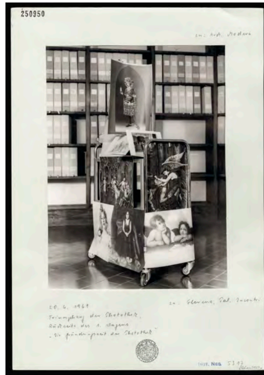
Fig. 5: The Triumph of Photography in the Fototeca: Wagon 1, Founding Time of the Fototeca, Kunsthistorisches Institut in Florenz – Max-Planck-Institut.

No less heterogeneous are the materials and representations from the second wagon (see Fig. 6), which was concerned with Firenze com'era (Florence as it was). Crowned by an engraving by the Parisian Lemercier company showing a view of Florence as seen from the Porta San Niccolò is a large-format photograph of the sculpture hall in the Uffizi in the center, flanked by staged photos of folkloristic genre figures and masquerade scenes.