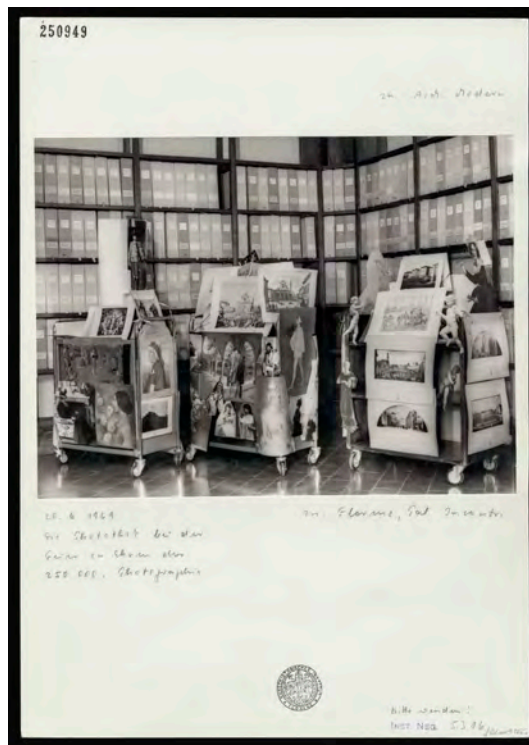
Fig. 4: Mounted Photographs of the Triumph of Photography in the Fototeca, Kunsthistorisches Institut in Florenz – Max-Planck-Institut.

Florence, and, at the foot of the carrello , a photograph of the active Mount Vesuvius, the 1906 eruption of which was one of its most powerful in 250 years. Also by Brogi, we see a very different genre on the side of the carrello , namely the reproduction of an elegiac portrait of a woman with a bouquet of flowers bearing the sentimental title Fior di Mestizia (Flower of Melancholy) that corresponds to the ideal of womanhood around 1900.