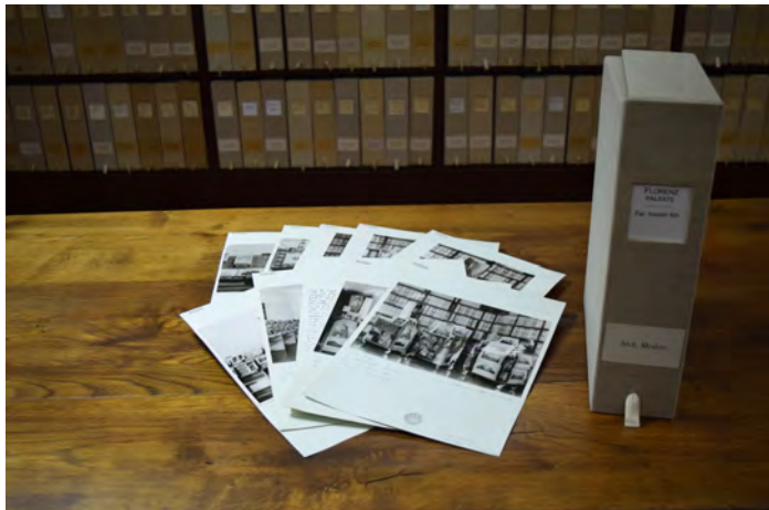
Fig. 1: Box with the Photographs of the Triumph of Photography in the Fototeca, Kunsthistorisches Institut in Florenz – Max-Planck-Institut.

A visit to the photo archive at the Kunsthistorisches Institut (KHI) in Florence's Via dei Servi. The year is 2014. I am working on Photographic Interleavings and conducting research on self-reflective picture-in-picture examples from the field of photography. For this purpose, I take down from the shelf the slipcase dealing with the architecture of the Palazzo Capponi-Incontri in Florence, the former home of the KHI's photographic collection. I find exterior and interior views of the building. This architectural shell of the photography collection found its way as a photographic representation into the archival box, which in turn makes up, together with other boxes, the collection that the institute's Fototeca, or photo library, contains in its interior: a kind of inward eversion has occurred, and a mise en abyme of the triad of representation, photographic objects, and their containers.