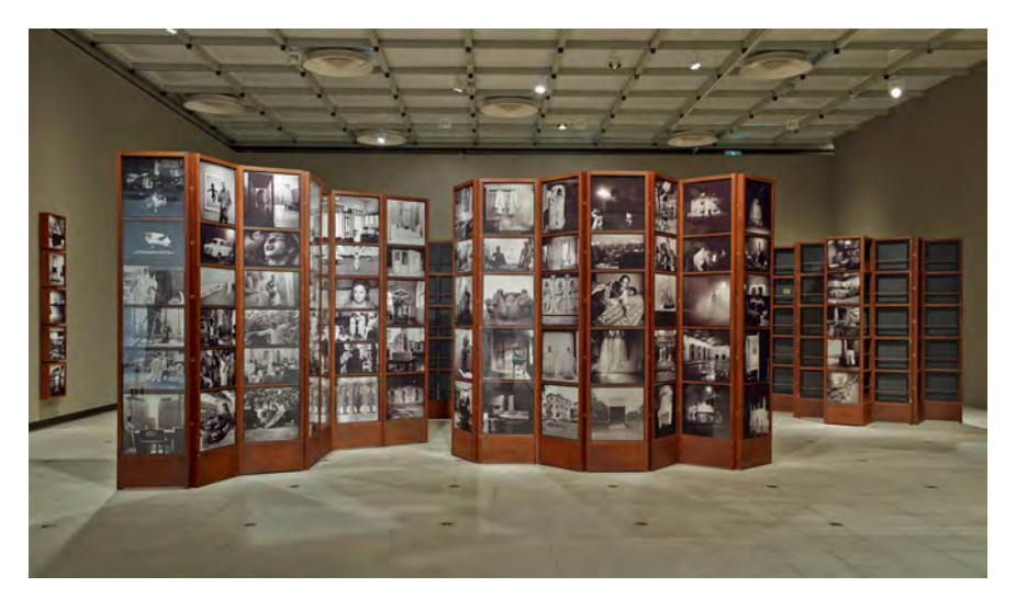
Fig. 12: Gallery view of the exhibition Museum Bhavan, 2015.