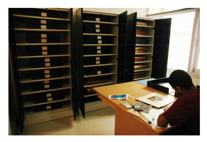
Fig. 8: View of the storage and archival research at the Alkazi Foundation, photo taken from the Alkazi Foundation's website.

tionally as a leading repository of Indian artefacts, bearing a format and reputation that correlate to international standards and methods of preservation. Here, one can find the greatest names in Indian colonial photography such as Samuel Bourne, Lala Deen Dayal, Cecil Beaton, and Felice Beato. The subjects of the images vary from architectural views of cities such as Lucknow and the erstwhile Vijayanagara Empire to portraits of royalty such as the Begums of Bhopal, exquisite platinum prints of the Nepalese royal family's portraits to affordable postcards and cabinet cards of exotic destinations and dancing girls, subsumed under "bazaar art." The archive in New Delhi holds all the images in hard copy, meticulously preserved in dehumidified rooms and acid-free sleeves with a digitized catalog (see Fig. 8).