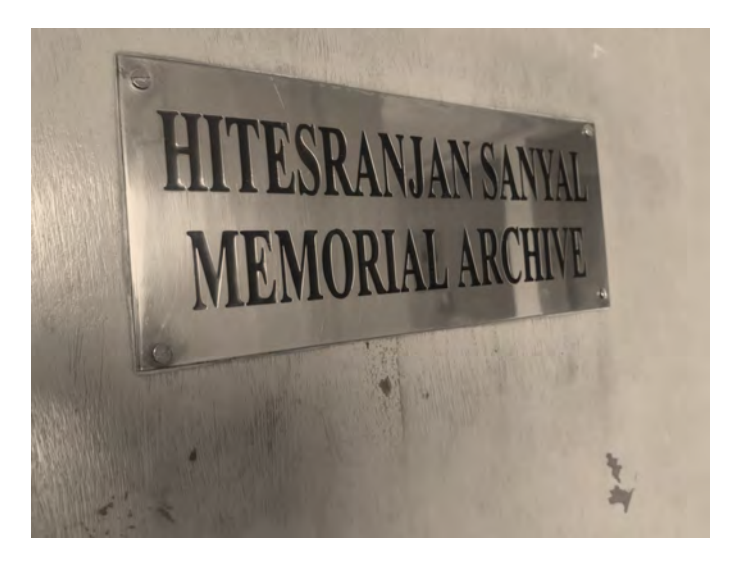
Fig. 6: The Hitesranjan Sanyal Memorial Archives, Centre for Studies in Social Sciences, Calcutta, courtesy of Ritwika Misra, 2017.

to further expand access. It runs with an open access policy, although seeking permission from donors for the reproduction of images (see Fig. 6).