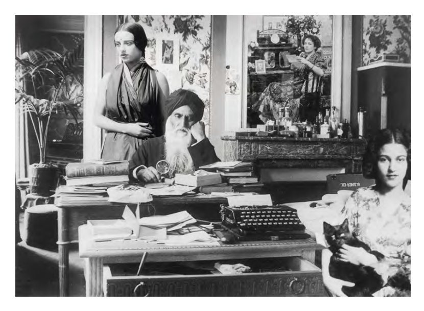
Fig. 15: Remembering the past, looking to the future, from the series Re-take of Amrita by Vivan Sundaram [Umrao Singh, Paris, early 1930s; Amrita, Bombay, 1936, photo, Karl Khandalavala; Marie Antoinette, Lahore, 1912; Indira, Paris, 1931]; digital photomontage, 38.1 x 53.3 cm, 2001, copyright: Vivan Sundaram.

myths in their growing complexity. Yet the tensions of loss and gain of information will never settle, always leaving the image incomplete of its full potential to convey meaning. It is only the acknowledgement of the parallel existence of the institutional archive, the virtual voluntary collection, the digitized or material-based archive, artistic interpretations, and the many, many family collections that enables a well-rounded photographic understanding of India's people.