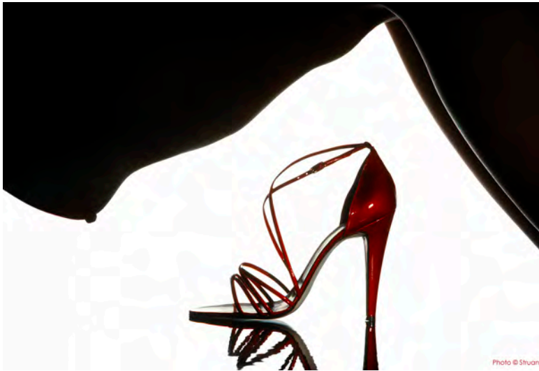
Fig. 3: Struan Campbell-Smith (Toronto), Red Shoe , 1977, Library and Archives Canada, Accession 1980-193, copy negative # PA-181604, courtesy: Struanfoto, Toronto.

The portfolio of Struan’s fashion photography held up a mirror to advertising images employed to sell everything from women’s shoes to car mufflers. Displayed large and out of context, his Quinto shoe photograph is a perfect study in layered looking. One can ask: What is it of ? What is it about ? What was it created to do ? On the surface, the photograph is of a naked woman bent over a shoe, but the Archives did not acquire the image to document the corresponding curvature of a 32A breast and a 6B stiletto shoe. Returned to the circumstances in which it was intended to be seen, the photograph is about sex and the exploitation of women in advertising. This points to its functional context of creation: the photograph was created to do something—to sell shoes.