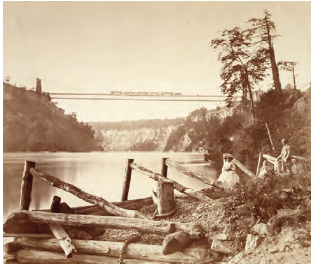
Fig. 2: [William England] London Stereoscopic Company, The Suspension Bridge, Niagara , 1859, Library and Archives Canada, Accession 1988-286, copy negative # PA-165997.

visible presence: it is a photograph of “treelessness.” For much of the nineteenth century, the assumption was that an absence of trees in a landscape signified aridity and a lack of agricultural potential. This stood as a critically significant barrier to dreams of westward territorial expansion on the North American continent. But this assumption had a timeline that took a dramatic U-turn in 1856 when scientific findings on the climatology of the United States disrupted the notion of the Great American Desert 5 (Blodget 1857, viii). By the time this photograph was taken, assumptions about barren desolation had given way to an Edenic vision of a transcontinental nation. What is missing from Hime’s quintessential image of the prairie was a litmus test; the “of-ness” of the photograph was interpreted very differently after new knowledge generated new expectations in what viewers brought to the act of looking.