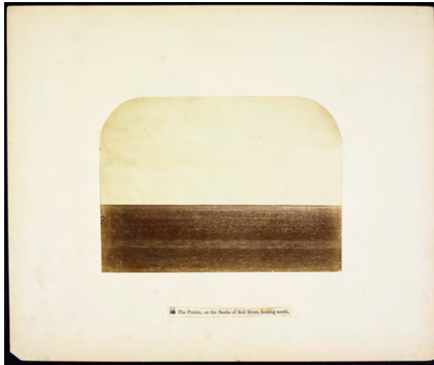
Fig. 1: Humphrey Lloyd Hime, The Prairie, on the Banks of Red River, looking south , September–October 1858, Library and Archives Canada, Accession 1936-273, copy negative # C-018694.

In her keynote, Lorraine Daston drew attention to durability as an assumption of the archive, pointing to assumption for the longevity of ancient inscriptions on paper squeezes and a map of the heavens on glass. The durability of the unexpected—of paper and glass over stone—points to contemporary archival concerns about longevity of born-digital images in an age of electronic communication and preservation. However, the elephant in the room was not the born-digital image but digitization, by which I mean the processes and consequences of scanning analog photo-objects, attaching metadata, and making surrogates available online. Mentioned more than once in passing, it is a topic that warrants close consideration by users of archives because of the capacity of creators and keepers of archives to efface and/or emphasize elements of photographic meaning-making in the dematerialization and decontextualization that so easily occurs, often inadvertently. This concern brings us full circle back to the power of archivists and others who are responsible for determining the value of images, ensuring their preservation, and providing access to them. In questioning where, how, and by whom the value of the photo-object is assigned, we tackle thorny assumptions about the nature of value as inherent or contingent, and about hierarchies of value.