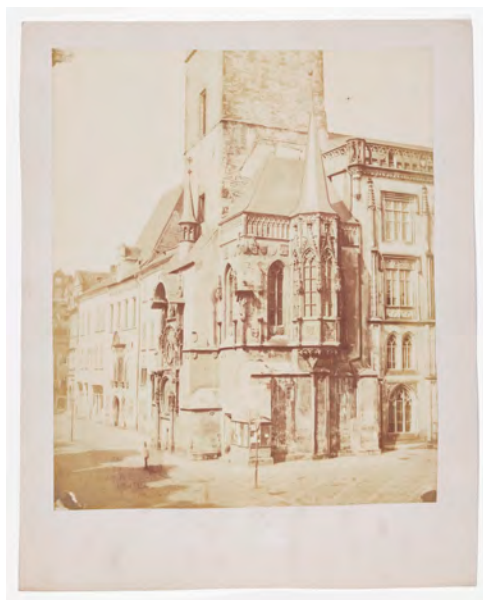
Fig. 6: The town hall in Prague's Old Town, Andreas Groll, 1856, salted paper print, 28.3 × 24 cm (photo), 35 × 28.7 cm (cardboard), Institute of Art History, Czech Academy of Sciences, collection of photographs, inv. no. 575

process, in particular travelling photographers like Groll were struggling to reduce their costs and alleviate physical hardship by creating a series of “master positives” right on the spot and then “recycling” the expensive glass plate for another shot.