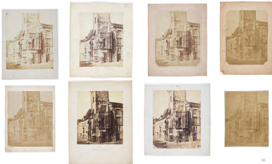
Fig. 12: The series of eight photographs of the town hall in Prague’s Old Town by Andreas Groll, 1856, Institute of Art History, Czech Academy of Sciences, collection of photographs, inv. nos. 575, 573, 576, 577, 578, 572, 574, 579.