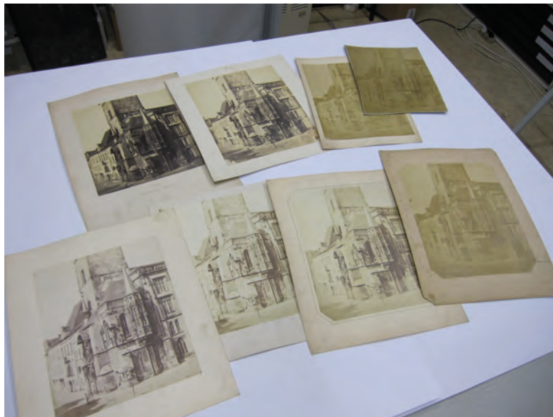
Fig. 1: The series of eight photographs of the town hall in Prague's Old Town by Andreas Groll, 1856, Institute of Art History, Czech Academy of Sciences, collection of photographs, inv. nos. 572–579, photo: Petra Trnková.

in the Old Town with its famous astronomical clock. If we look at guide books and prints of the period, we will see that the popularity of this eminent building and its picturesque surroundings among tourists dates back at least to the early nineteenth century. Tourists were not the only ones enchanted, however. Since the building served as authentic evidence of the famous past of the Bohemian capital, it also attracted attention from ciceroni as well as scientists—archaeologists and historians of architecture—throughout the whole nineteenth century.