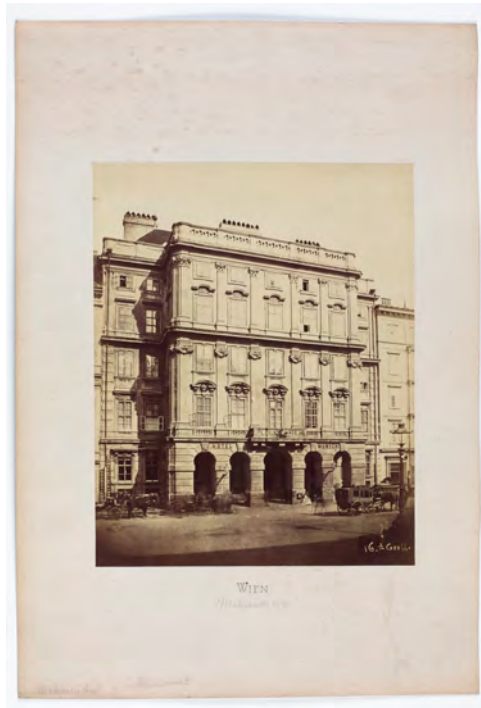
Fig. 10: Hotel Munsch, Vienna, Neuer Markt 5, Andreas Groll, after 1866, albumen print, 28.4 × 22.3 cm (photo), 47.3 × 32.3 cm (cardboard), Institute of Art History, Czech Academy of Sciences, collection of photographs, inv. no. 697, photo: Jitka Walterová / Institute of Art History, Czech Academy of Sciences.

that the print once used to be part of another coherent pictorial series. Its fragments can actually be found in other parts of the IAH photographic collection, mostly among prints categorized as “Viennese views.” They all have the same layout (see Fig. 10)—the same typography, same ink, a similar quality of print, and are made of the same material, as well as the width of the supporting layer being the same.