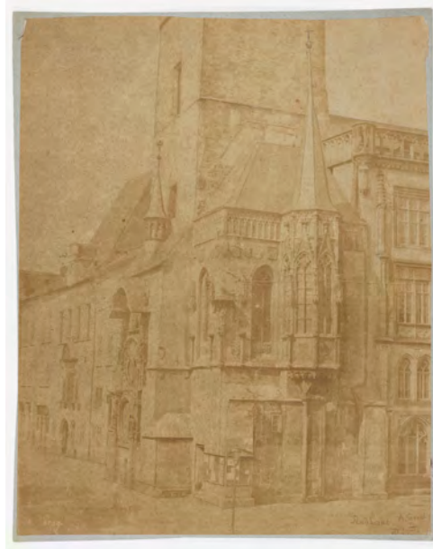
Fig. 3: The town hall in Prague's Old Town, Andreas Groll, 1856, albumen print, 27 × 21.3 cm (photo), 27.8 × 22 cm (cardboard), Institute of Art History, Czech Academy of Sciences, collection of photographs, inv. no. 579, photo: Vlado Bohdan / Institute of Art History, Czech Academy of Sciences.

dom's greatest eras of the fourteenth to sixteenth centuries. Consequently, the south wing became the central theme of discussions surrounding the building's appropriate appearance. The municipality was pushing ahead the plan to adapt the building by emphasizing putatively “Bohemian”—and from a certain point in time also “Czech”—character. On the other hand, the state—in this case represented by the vicegerency, the Central Commission and its deputy Johann Erasmus Wocel—favored conservation of the building complex in its current state over reconstruction or the supposedly ideal adaptation.