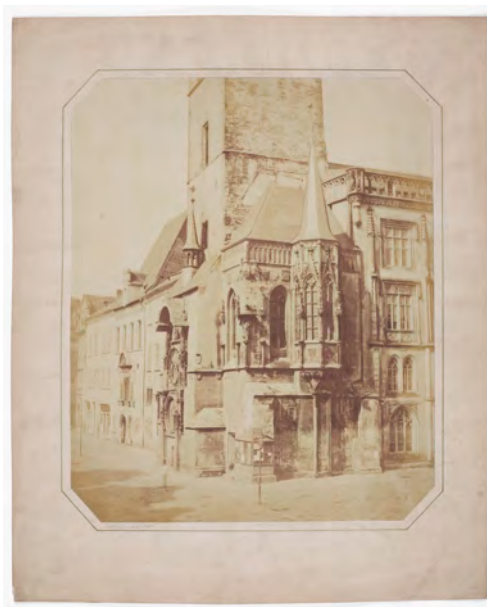
Fig. 4: “Photo A. Groll 1856.” The town hall in Prague’s Old Town, Andreas Groll, 1856, albumenized salted paper print, 28.4 × 23.2 cm (photo), 37.6 × 30.5 cm (cardboard), Institute of Art History, Czech Academy of Sciences, collection of photographs, inv. no. 576, photo: Vlado Bohdan / Institute of Art History, Czech Academy of Sciences.

have been so many copies of Groll’s photographs preserved in local collections, especially in museums and institutions involved in monument care, as well as architects’ estates.