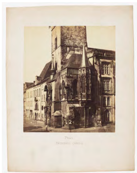
Fig. 2: The town hall in Prague’s Old Town, Andreas Groll, 1856, albumen print, 27 × 23 cm (photo), 42 × 32.3 cm (cardboard), Institute of Art History, Czech Academy of Sciences, collection of photographs, inv. no. 572, photo: Vlado Bohdan / Institute of Art History, Czech Academy of Sciences.

1988). The city of Prague with its splendid late Gothic architecture was one of the places, along with Vienna and Kutná Hora (Central Bohemia), that received special attention.