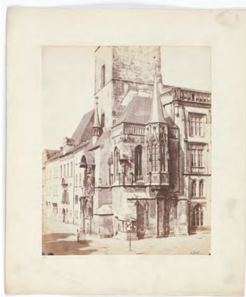
Fig. 5: The town hall in Prague's Old Town, Andreas Groll, 1856, salted paper print, 27.8 × 22.5 cm (photo), 38 × 32 cm (cardboard), Institute of Art History, Czech Academy of Sciences, collection of photographs, inv. no. 573, photo: Vlado Bohdan / Institute of Art History, Czech Academy of Sciences.

the shadows and even more so from the fuzzy, ghost-like figure of a guard standing in front of the town hall; incidentally, these “ghosts” (compare Fig. 2 and 5 in Hyperimage) first sparked my interest in the series. Knowing for certain that Groll exposed—quite expectedly—more than one negative here, we become less prone to believe to the rather common idea of a photographic genius traveling a long way to Prague and climbing up to the top floor of a building with all his heavy photographic equipment to produce just one perfect shot of the town hall.