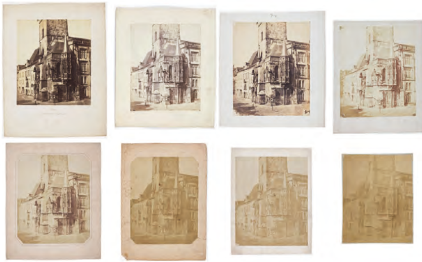
Fig. 11: The series of eight photographs of the town hall in Prague’s Old Town by Andreas Groll, 1856, Institute of Art History, Czech Academy of Sciences, collection of photographs, inv. nos. 572–579.