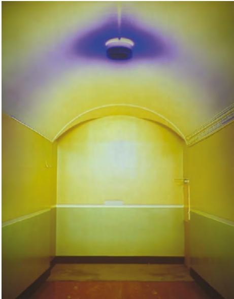
Figure 8: Corridors (Ash) , Catherine Yass, 1994, (T07069), Tate © Catherine Yass.