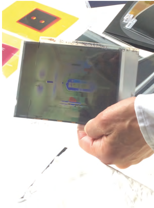
Fig. 5: The sandwich of two layers of transparency used in the production of Daffodil 2 , photograph taken in Catherine Yass's studio © Tate.

played in the future, and how the works might be displayed. At the time of acquisition, time-based media conservation was the responsible conservation section for color display transparency light boxes, in part due to the perception that the skills for dealing with artworks that had to be “plugged in” lay in time-based media conservation rather than paper conservation, the traditional domain of photographs. This meant that initial conversations about this form of conservation were influenced by current time-based media conservation practice: namely, the idea that the future reproducibility of a work might be facilitated by the collection of a “master” image from which the work could be reprinted, should the need arise. Therefore, coincidentally, discussions about reproduction begun with Yass earlier than would have been common in the photograph or paper conservation studios within museums.