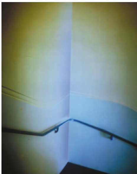
Figure 10: Corridors (Personnel) , Catherine Yass, 1994, (T07071), Tate © Catherine Yass.