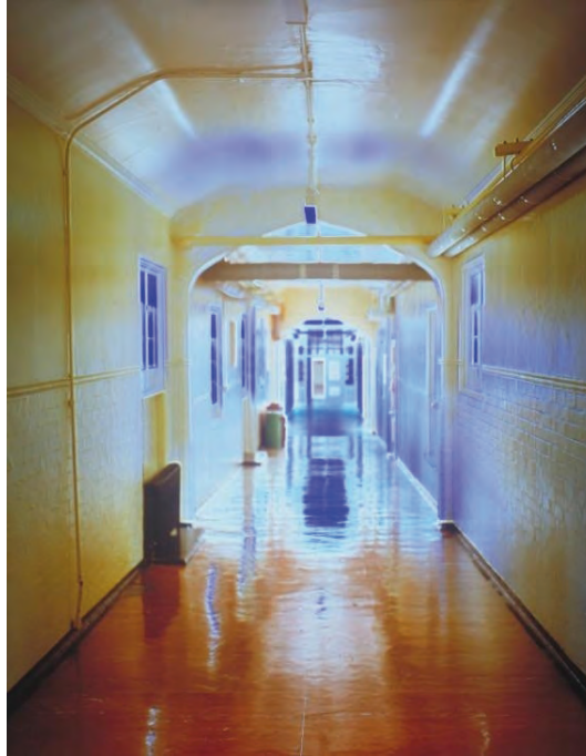
Fig. 1: Corridors (Chaplaincy) , Catherine Yass, 1994, (T07065), Tate © Catherine Yass.

materials used are either obsolete or in decline, drawn as they were from the fast-moving world of commercial photographic production. In the rest of this essay we unpack how entangled processes of making, social relations of production, and the nature of materials are to constituting an epistemology of the photo-object.