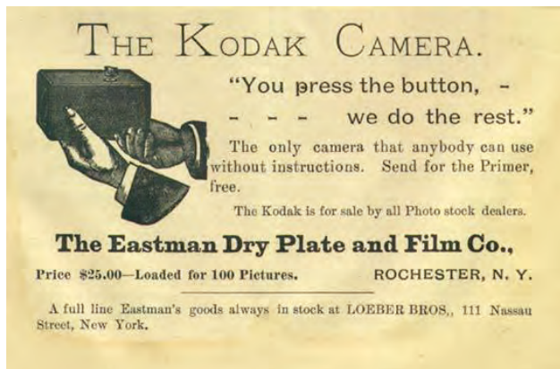
Fig. 6: A Kodak camera advertisement published in the first issue of The Photographic Herald and Amateur Sportsman , November 1889, Wikimedia Commons.