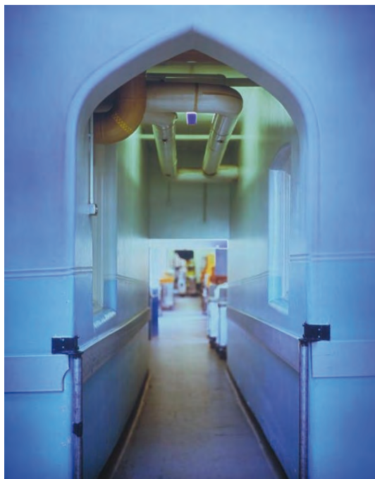
Fig. 2: Corridors (Kitchen) , Catherine Yass, 1994, (T07066), Tate © Catherine Yass.

In 1994, Catherine Yass was commissioned by the Public Art Development Trust to make a series of images for a psychiatric hospital in South West London that had been built in the nineteenth century. Responding to the use of photography in research into mental illness in the nineteenth century, the photographs used in Corridors were originally intended as backgrounds to portraits of people who either currently worked or were being treated in the hospital (Adams and Hilty 2000). However, Yass became uncomfortable with photographing those who had little or no choice regarding their presence within the hospital and became increasingly interested in the images of these empty spaces and how they swallowed up the identity of those within them. Yass also began to engage with how the architecture of the hospital was depicted in archival photographs, with an emphasis on the central human gaze, mirrored in the lighting of the architecture running down the center of the ceilings of the corridors suggesting ideas of salvation. She therefore decided to focus on creating the images of the corridors and these in-between spaces.