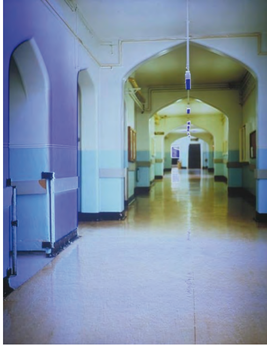
Fig. 3: Corridors (Daffodil 1) , Catherine Yass, 1994, (T07067), Tate © Catherine Yass.

inch plate camera loaded with a double-sided dark slide. 18 On one side of the dark slide is a sheet of Velvia color reversal film “correctly” loaded, with the emulsion side facing the lens, and on the other side of the dark slide is a sheet of Velvia color reversal film loaded “incorrectly,” namely, with the emulsion side facing away from the lens. 19 From this Yass created two exposures, as closely identical as possible. Taking these two images, she processed the correctly loaded film using the E6 20 process to obtain a positive and processed the incorrectly loaded film using the C41, 21 which is designed for processing negatives. This provides the distinctive visual effects we see in the Corridors series.