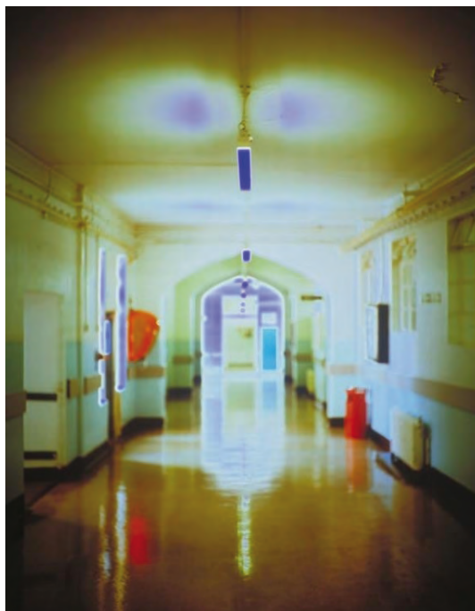
Fig. 4: Corridors (Daffodil 2) , Catherine Yass, 1994, (T07068), Tate © Catherine Yass.

tories, Edenbridge) where Yass printed the Corridors series not only had autofocus but also had computer control of the color of the light, making it possible to adjust the colors in the image by very small increments. The transparent Cibachrome material, CC.F7, considered an expensive photographic material, was only produced between 1992 and 2012 (Pénichon 2013) with the end of its production signaling the point when the network and infrastructure underpinning the making of these works rapidly fell apart. 23 In a message to customers posted on a message board in 2011, the manufacturer of Cibachrome, Ilford, announced the end of production for this material, citing the cost of silver as one of the major causes. 24 The material has a polyester base and is made up of multiple layers of light sensitive silver salts and azo dye (Pénichon 2013). The eight works in the Corridors series are presented as individual light boxes, made up of white painted wooden boxes in which fluorescent lamps are used to light the transparency from the back. The transparency is placed on a piece of opal Perspex and held in place by a standard white painted wooden molding that creates a frame. The surfaces of the transparencies are unprotected and extremely fragile, marking and scratching easily.