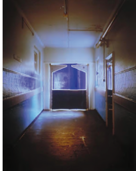
Figure 9: Corridors (Modern Team Base) , Catherine Yass, 1994, (T07070), Tate © Catherine Yass.

printing Corridors . At the same time, utilizing other techniques, such as scanning and digital processing, we may still be able to recreate the image. There is however more than one kind of politics to this—in prioritizing the image as an index of the artist’s intention, digital scanning and printing can efface the labor and expertise that went before it in the form of earlier processing techniques. If we do not unpack the studio work and labor that goes into digital processing, we run the risk of conservation practice deliberately maintaining a separation between the work and the conditions of its production—and we believe that there are implications for how images then go on to be interpreted and understood when they are put on display. We argue here that this context, in the case of this image, is important in coproducing the meaning of the photograph. There are two kinds of indexicality at play here in making this image—the indexicality of the hospital, and its infrastructure of care, and the indexicality of the materials and the care and skills that these require.