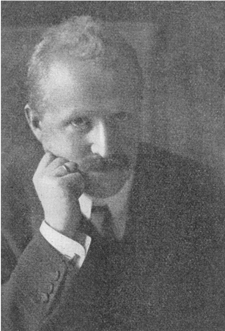
Figure 3.1: Otto Sackur, 1880–1914.